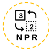
Numerical Part Replacement