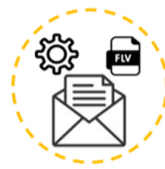
Service Letter/ Flash File