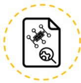
Troubleshooting / Schematic