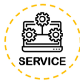
System Operation, Testing adjusting Assembly disassembly, etc.